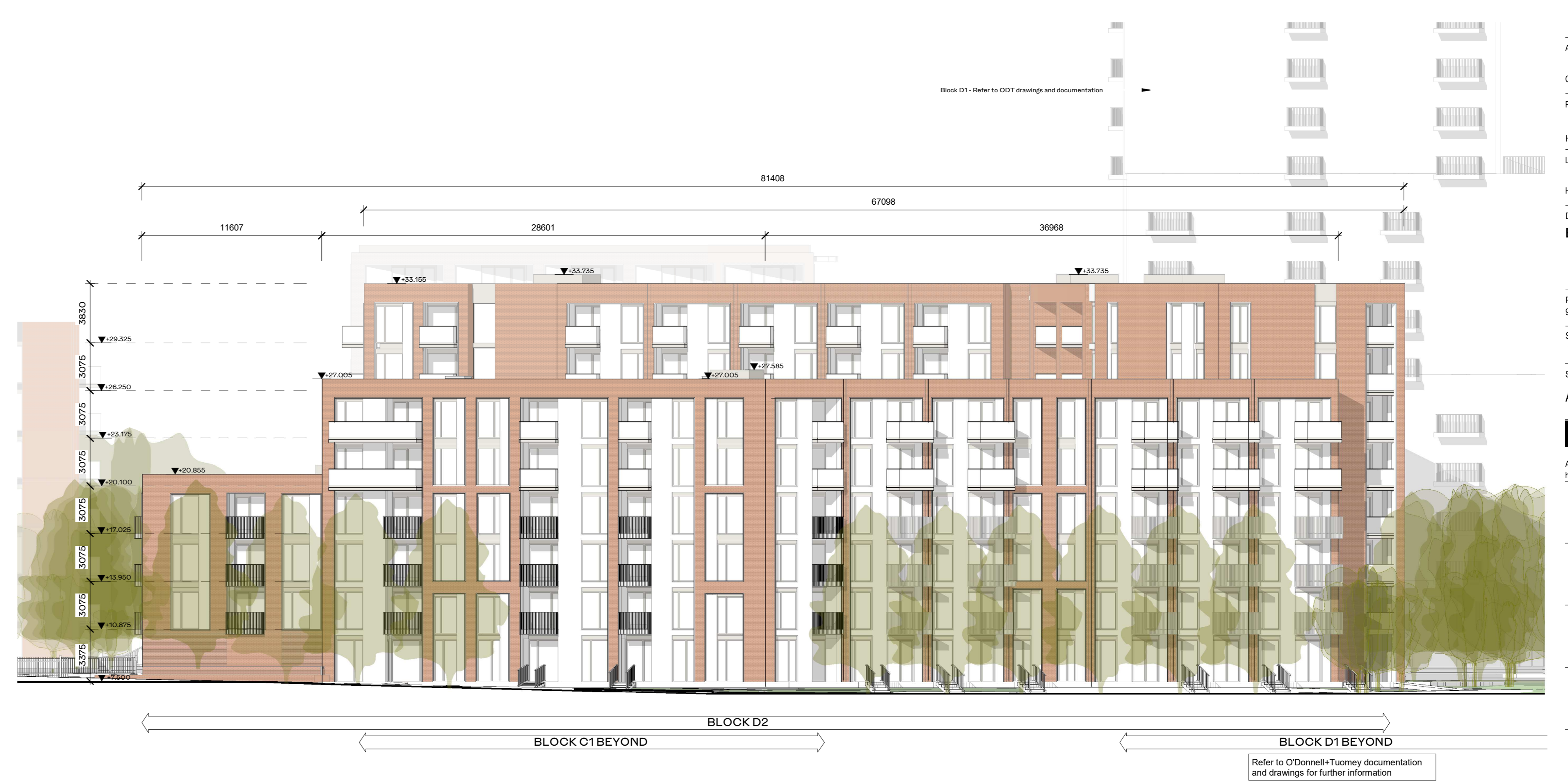
4 Block D2 Proposed East Elevation 1 : 200