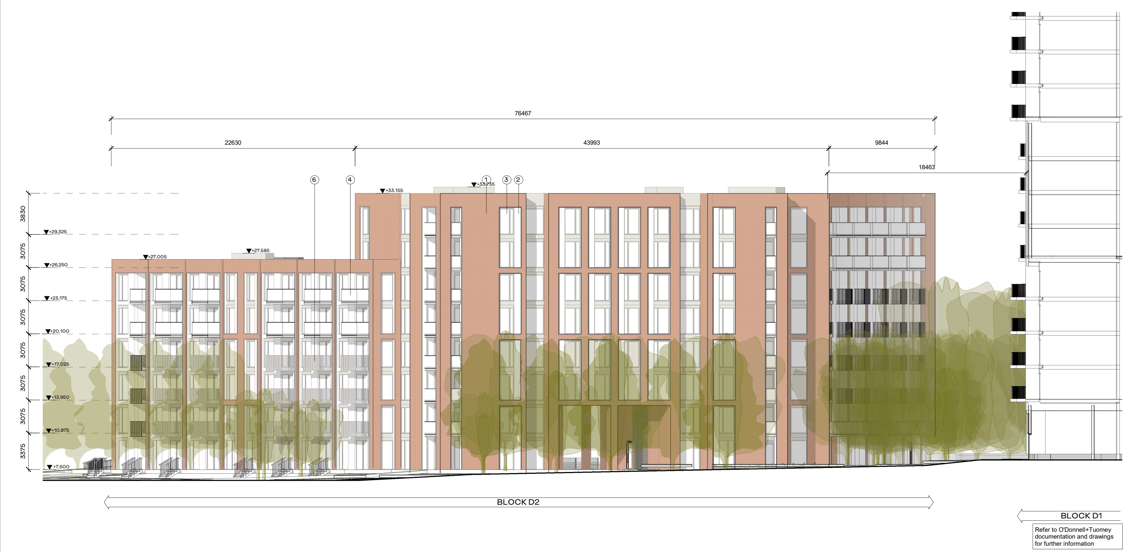
1 Block D2 Proposed North Elevation 1 : 200