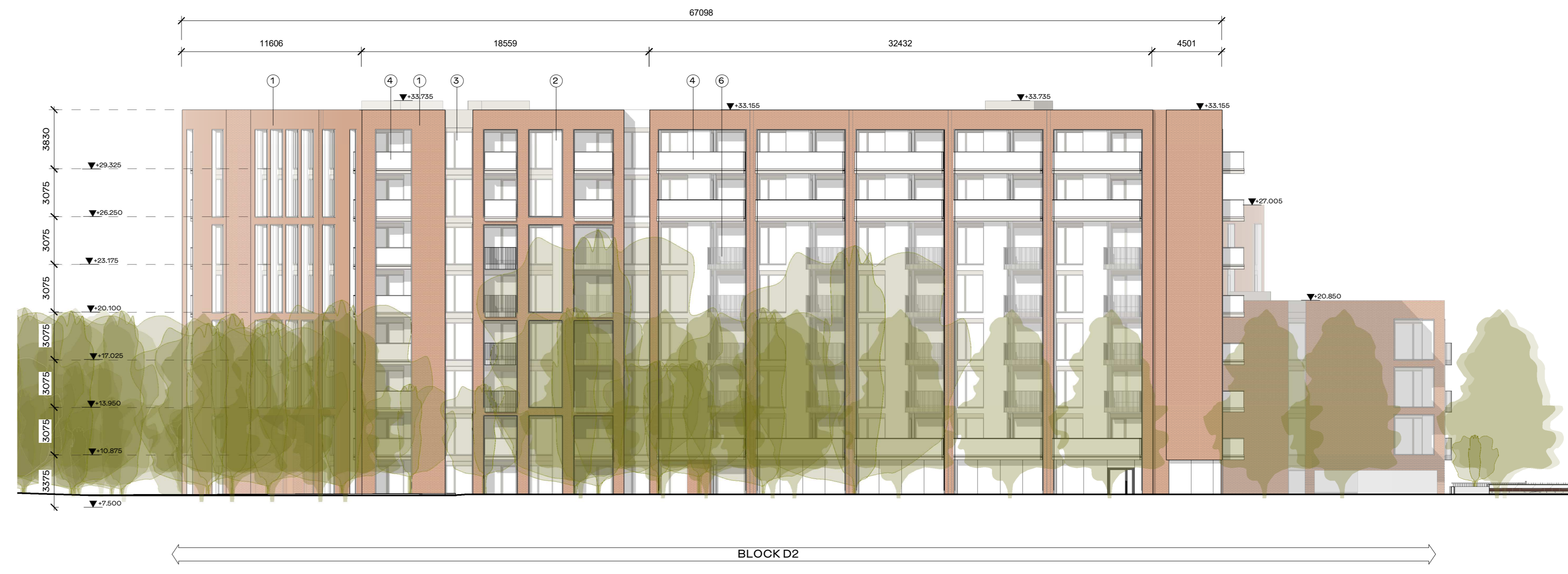
2 Block D2 Proposed West Elevation 1 : 200